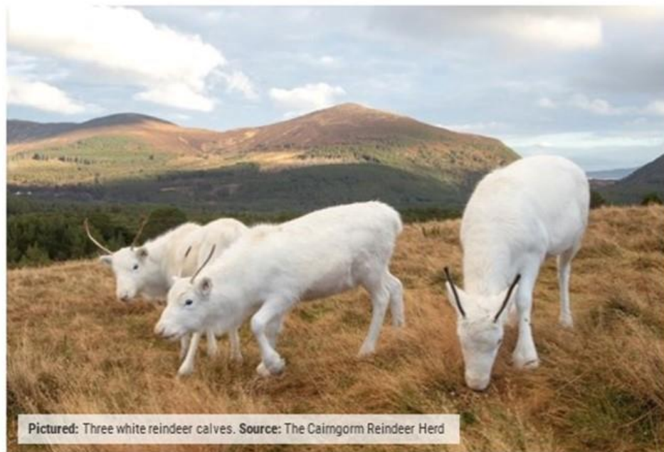
Pictured: Three white reindeer calves.