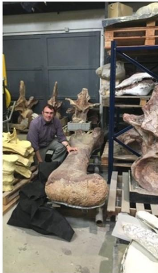
Pictured: Professor Paul Barrett showing the scale of Patagotitan

The Natural History Museum, in London, is getting a new dinosaur to display and it's the biggest so far! The colossal titanosaur Patagotitan mayorum, the largest known creature to have ever walked our planet, is going on display for the first time ever in Europe. The cast of Patagotitan mayorum is being loaned to the museum by the Museo Paleontologico Egidio Feruglio in Argentina, which excavated the giant skeleton in 2014. The giant prehistoric creature is much bigger than the museum's other exhibits, weighing 57 tonnes (four times heavier than Dippy the Diplodocus) and measuring 37 metres (12m longer than Hope the blue whale). Professor Paul Barrett, science lead for the exhibition, said, 'Patagotitan mayorum is an incredible specimen that tells us more about giant titanosaurs than ever before. Comparable in weight to more than nine African elephants, this star specimen will inspire visitors to care for some of the planet's largest and most vulnerable creatures, which face similar challenges for survival, and show that within Earth's ecosystems, size really does matter.'