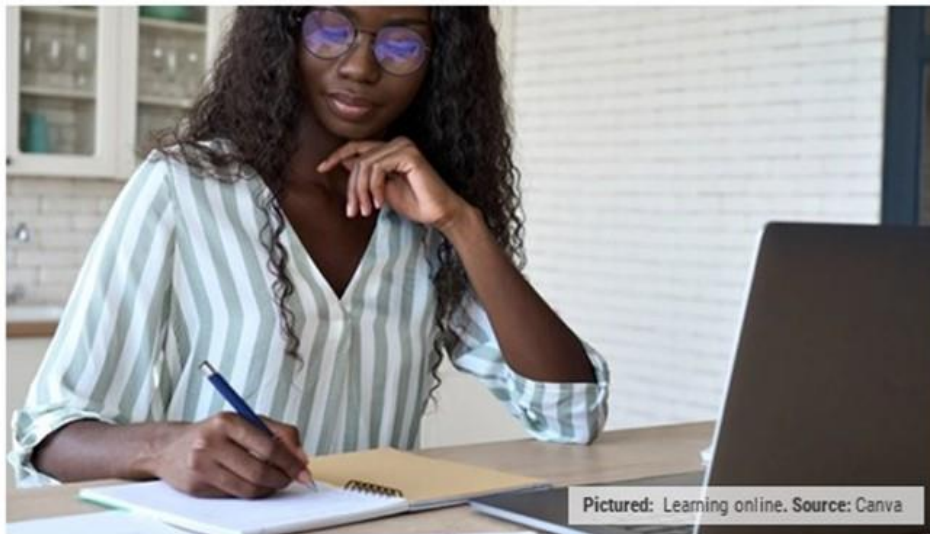
Pictured: Learning online.