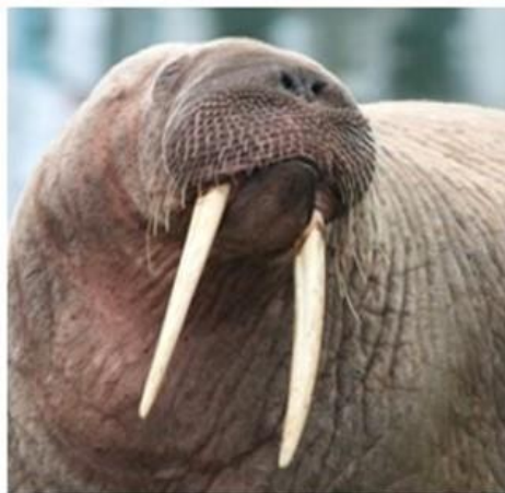
Pictured: Thor the Walrus in Scarborough