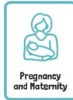
Pregnancy and Maternity