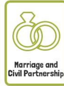
Marriage and Civil Partnership