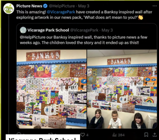
Vicarage Park School