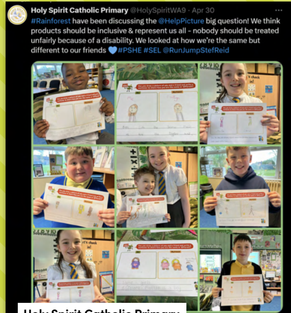
Holy Spirit Catholic Primary