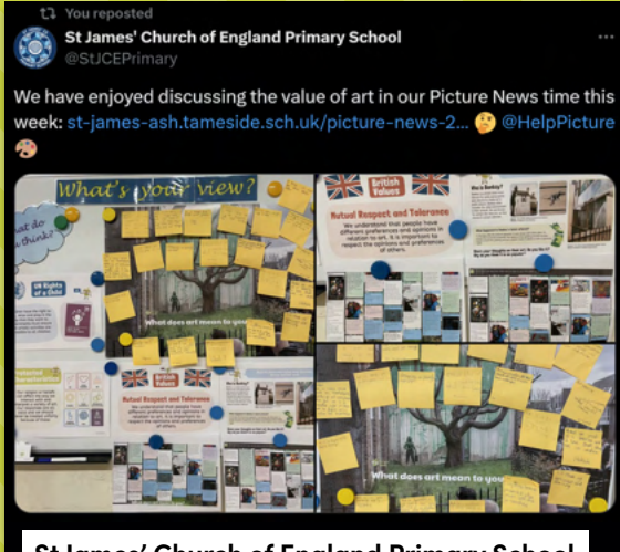
St James' Church of England Primary School

Our schools have been busy exploring their weekly news packs. Here's some recent impressive news-based work!