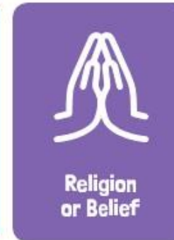
Religion or Belief