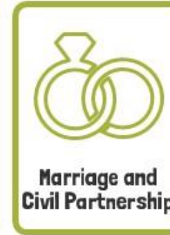
Marriage and Civil Partnership