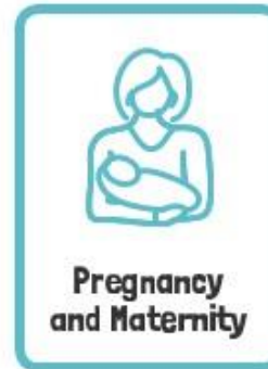
Pregnancy and Maternity